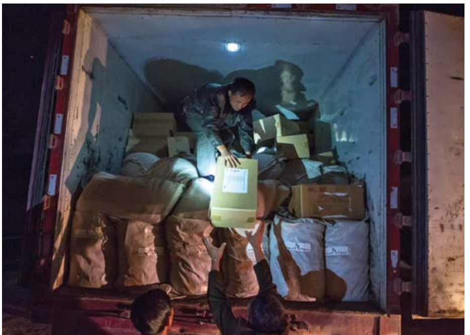
Workers unload a First Steps' shipment of relief supplies.