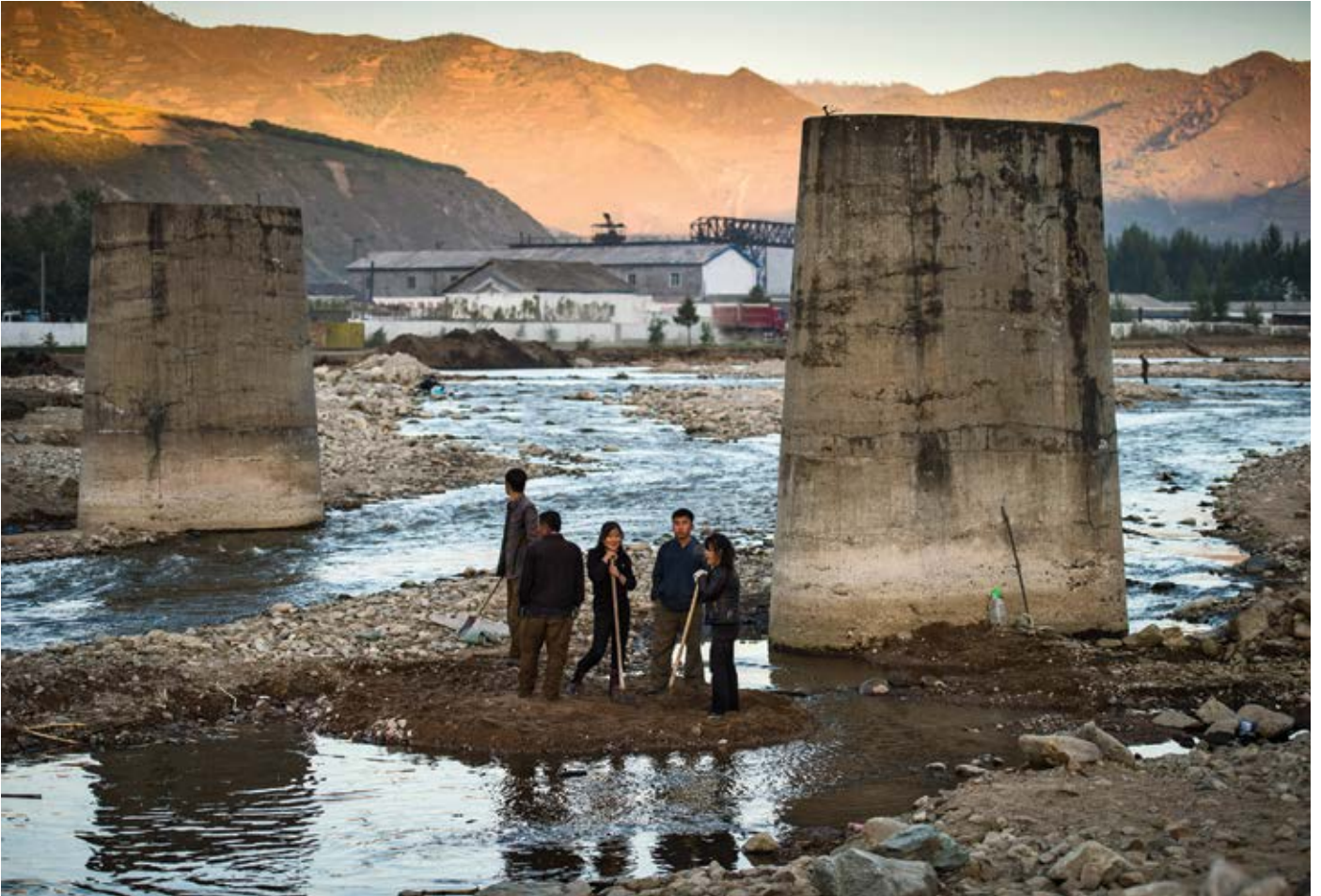
In Musan County, a group of workers stand beside one of the region's many destroyed bridges.

were people of all ages gathering stones, which I assume will be used in construction. People are working hard to try to get their lives back on track.”