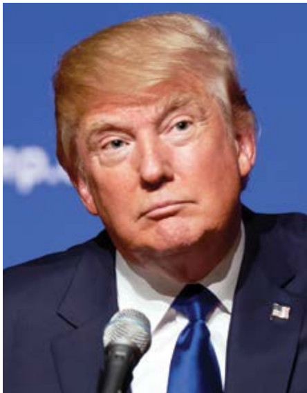
Donald Trump at the New Hampshire Town Hall at Pinkerton Academy, Aug. 19, 2015.