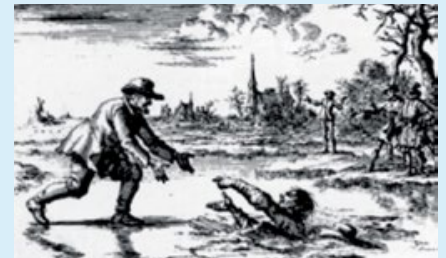
Jan Luyken engraving of Dirk Willems saving his captor from drowning published in Martyrs Mirror, 1685.