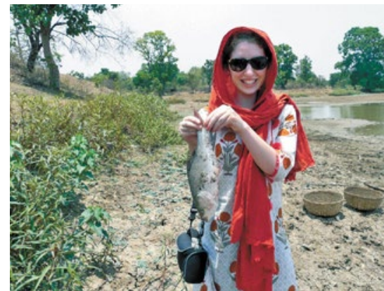
I caught this fish with my own hands!