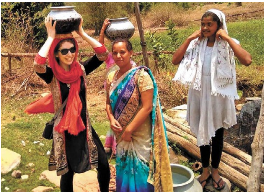
Carrying water on my head.

It’s a lesson I needed to learn, and to continue learning. God’s grace is not about my worthiness. And good hospitality isn’t either. It’s about the generosity, the humility and servant leadership, the love being expressed by the giver. And so, I remove my shoes, extend my dirty feet, and receive this cleansing water with gratitude and awe. ☺