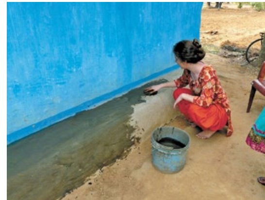
A mud, manure and water mixture is used to make and maintain homes.