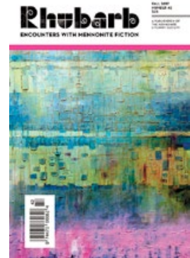
The final issue of Rhubarb magazine

were a mix of people still connected to the church and others with little adult experience of church. Among the latter she says, "the overriding sentiment is not so much resistance or rejection, but ambivalence and often a deep sense of loss of a community that sometimes seemed, in their experience, to fall far short of its ideals."