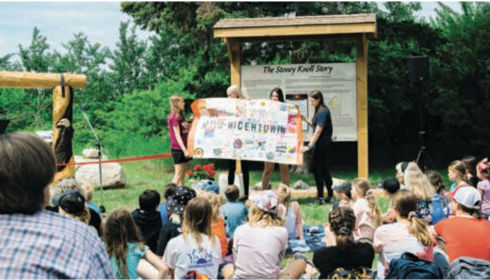
Students from Rosthern Community School in Rosthern, Sask. hold up a collaborative art “quilt” they made for the event.