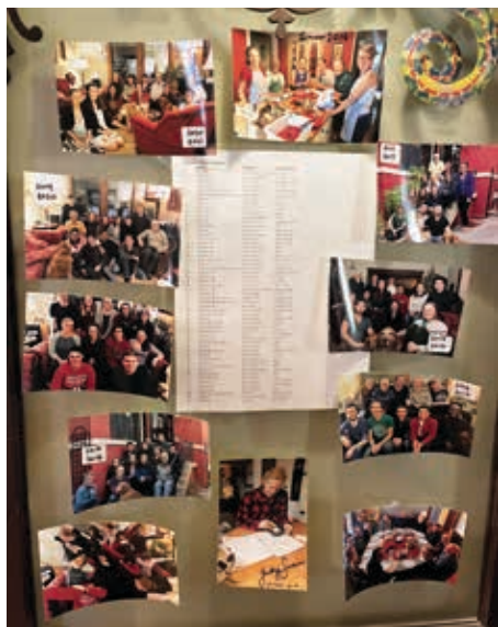
Fifty-six different people lived at Emmaus House over its eight years of operation.

always around the table, as people blessed us with the work of their hands and took delight in sharing food,” Rod says. He misses sitting in the kitchen and always being able to count on someone coming through and stopping to talk for a while.