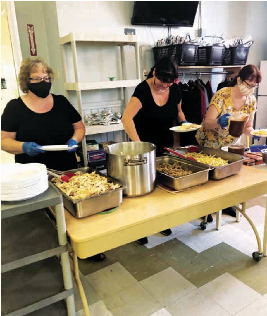
The staff of Westview Centre4Women prepares a meal in the Centre's kitchen.